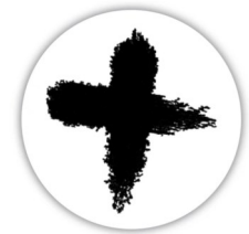
Ash Wednesday Sticker

February 17 at Noon in the Sanctuary or live on zoom. Recordings will be posted by late afternoon. Because the imposition of ashes is going to look very different this year, we will hand out stickers in place of ashes to allow our congregants to still take part in the imposition of ashes (in a new way)! If you are not participating in in-person worship, please call the church to arrange to pick up your sticker or have it mailed to you.