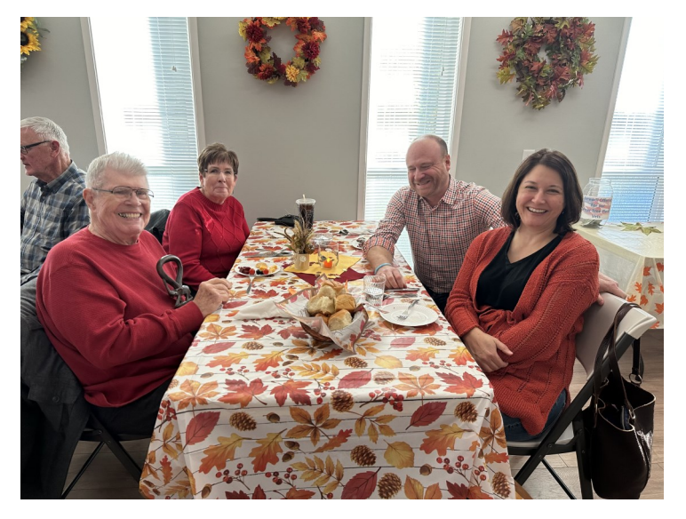
FALL HARVEST DINNER